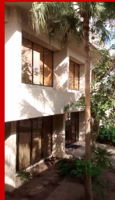
View from City Plaza, 1034 E. Levee St. 2 nd Floor Brownsville, TX