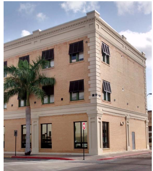
El Tapiz Building, 1150 E. Adams St. 3 rd Floor Brownsville, TX